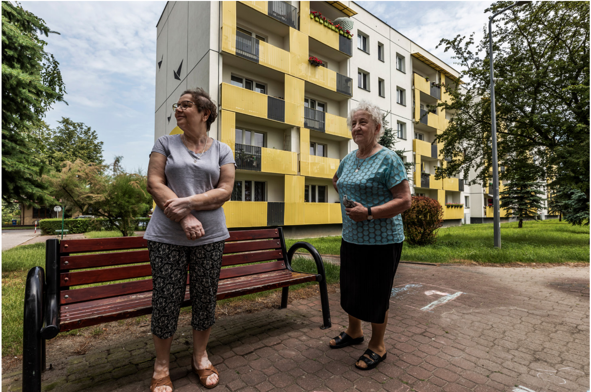
Zwolén, Poland - Inhabitants of one of the Soviet-era housing units that have been regenerated with photovoltaic panels and heat pump systems.