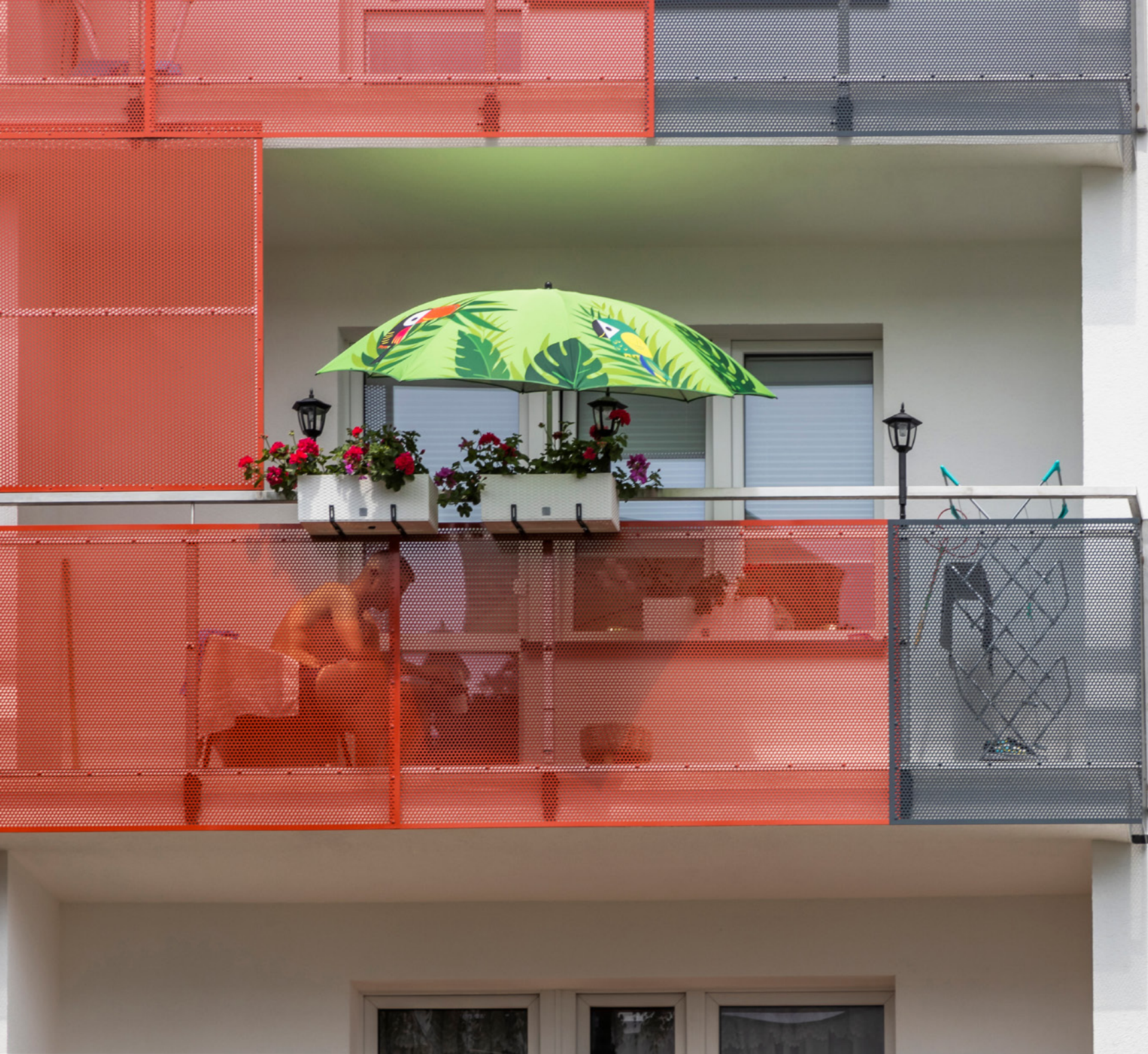
Zwolén, Poland - A resident of one of the Soviet-era housing units that have been regenerated with photovoltaic panels and heat pump systems.