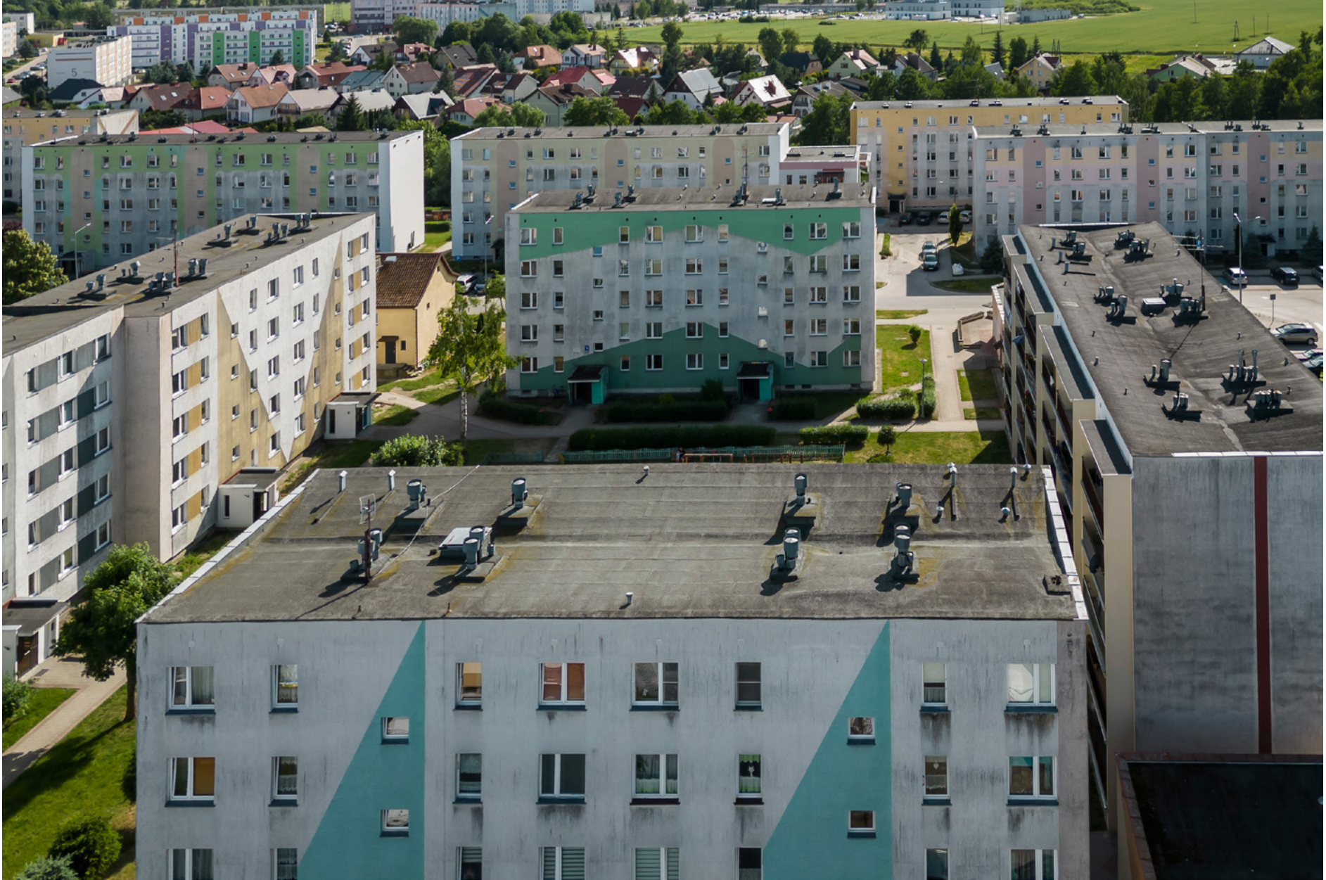
Bartoszyce, Poland - A series of Soviet-era housing units that will be regenerated with photovoltaic panels and heat pump systems.