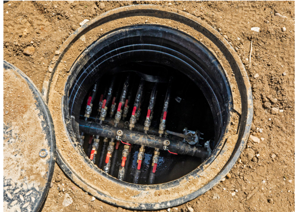
Lidzbark Warmiński, Poland – Passages for underground pipes for the heat pumps of the Heating Pump of the Future experimental plant, which is currently under construction; once completed, it will be used to heat several housing units.