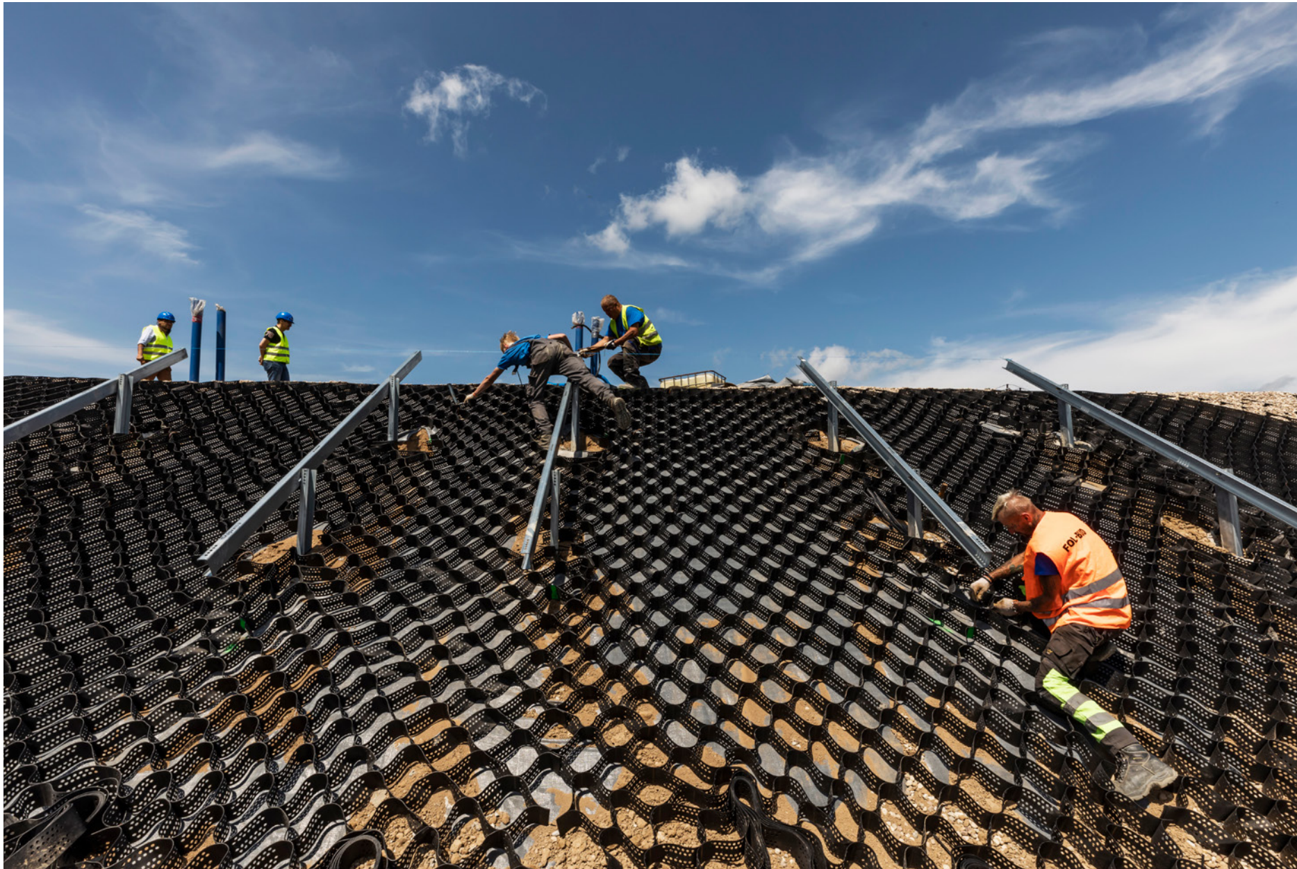
Lidzbark Warmiński, Poland - Workers at work on the embankment containing the water reservoir that will serve as storage for the experimental Heating Pump of the Future plant, which is currently under construction and, once completed, will be used to heat several housing units.