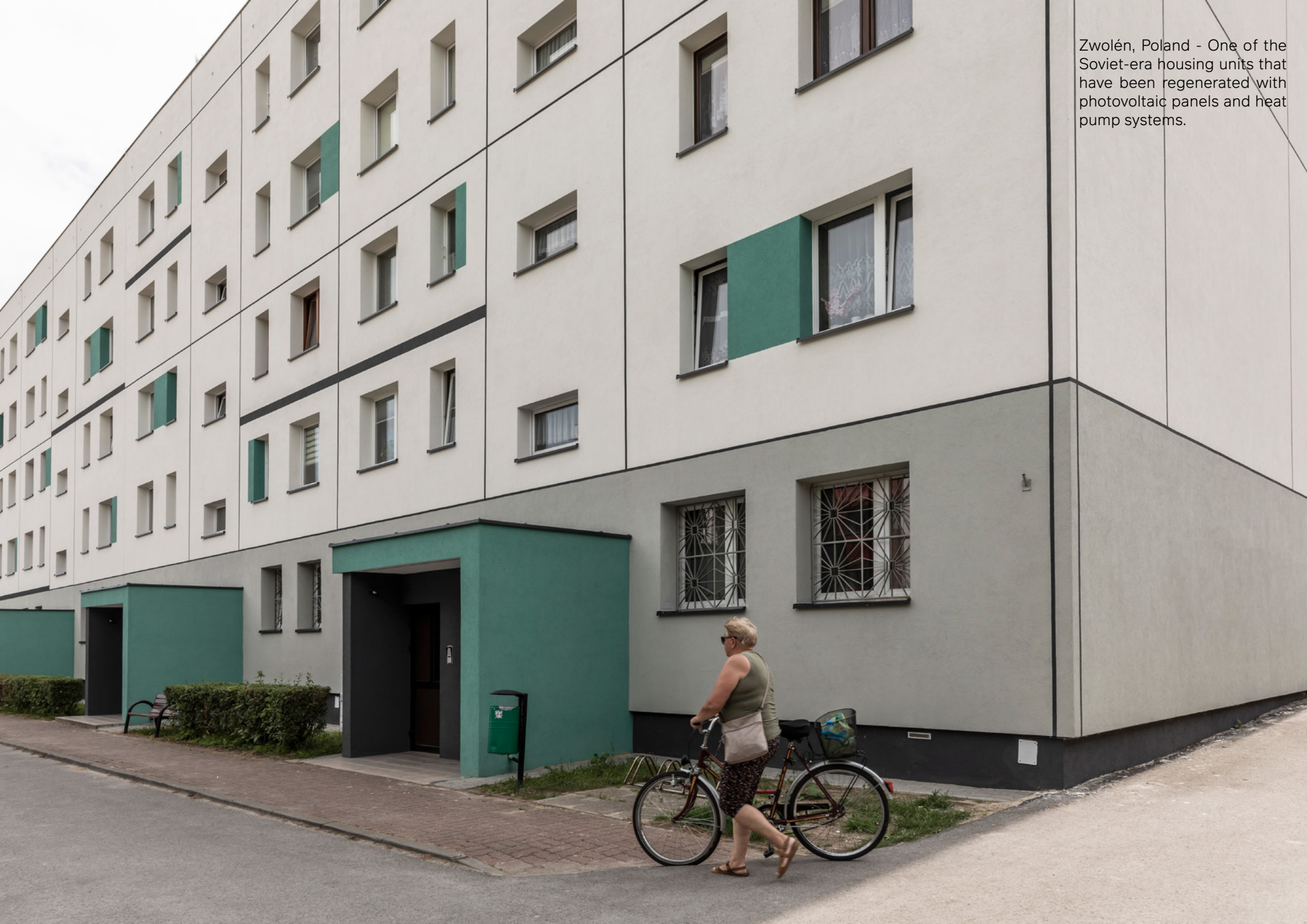
Zwolén, Poland - One of the Soviet-era housing units that have been regenerated with photovoltaic panels and heat pump systems.