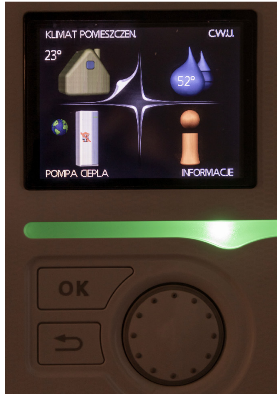
Ceglowo, Poland - The control panel of a heat pump for Soviet-era Ceramik housing units that have been regenerated with photovoltaic panels and heat pump systems.