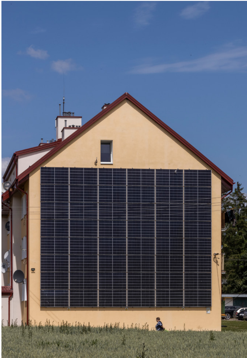
Ceglowo, Poland - The photovoltaic panel wall of one of the Soviet-era Ceramik housing units that have been regenerated with photovoltaic panels and heat pump systems.