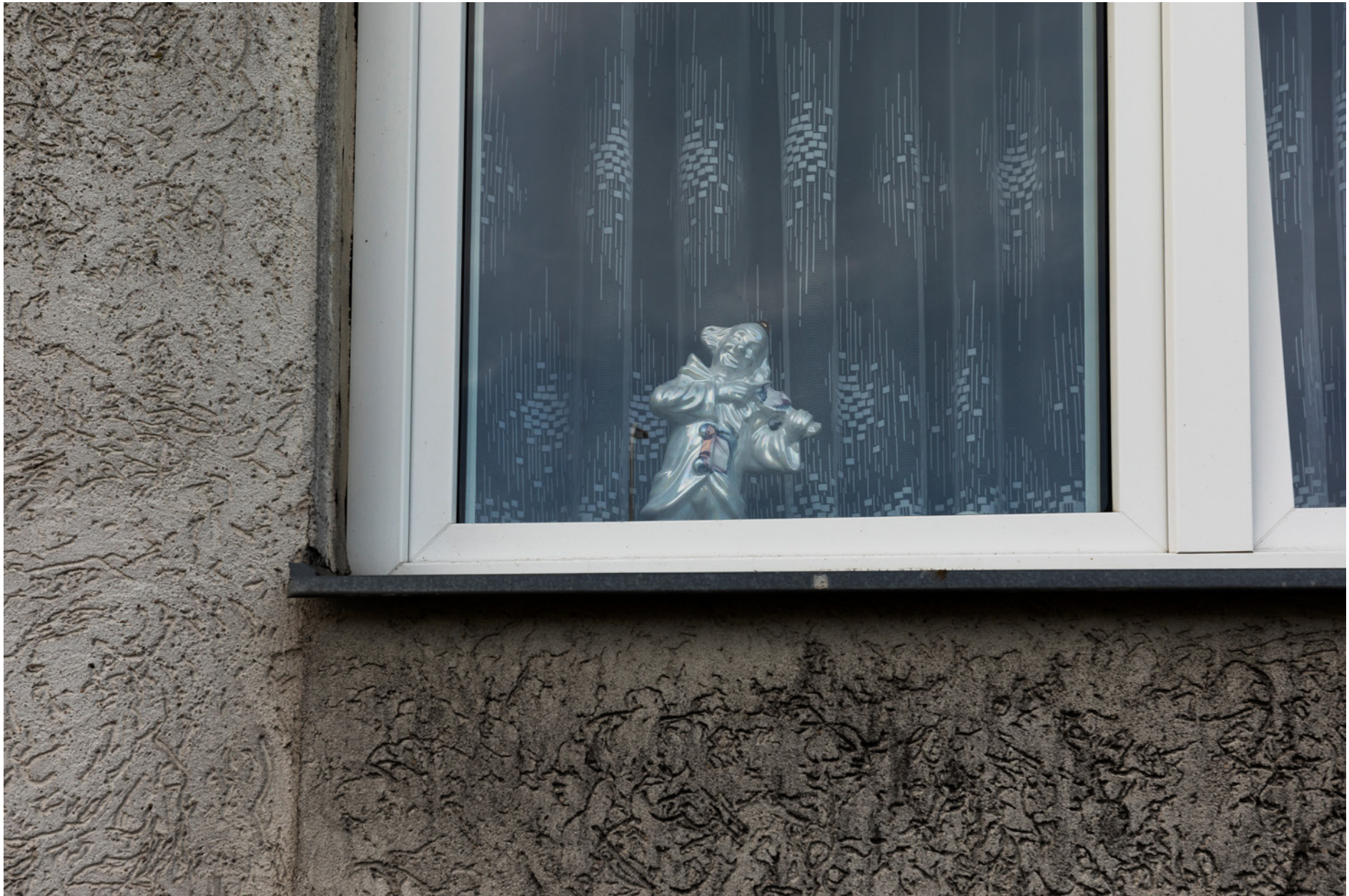
Bartoszyce, Poland - The window of a Soviet-era building. This is part of a series of housing units that will be regenerated with photovoltaic panels and heat pump systems.