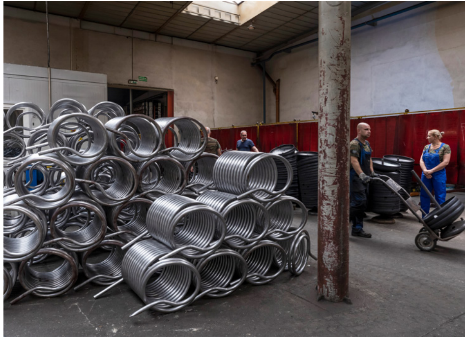
Giubczyce, Poland - A production stage of the Galmet company, which makes and assembles heat pumps.