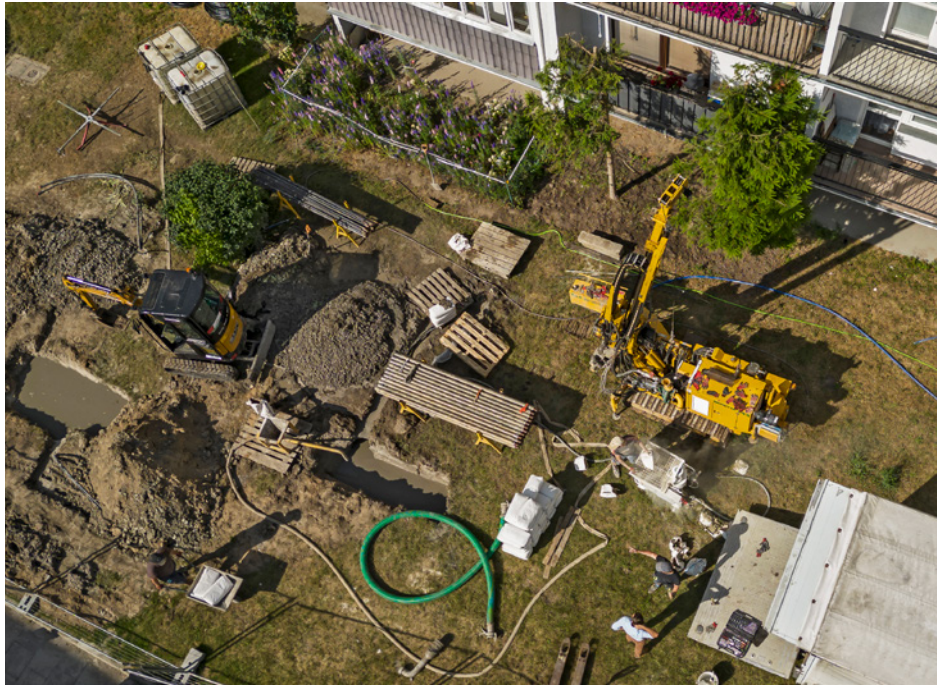
Bartoszyce, Poland - Drilling for the installation of heat pump sensors that will heat a group of Soviet-era housing units that will be regenerated with photovoltaic panels and heat pump systems.