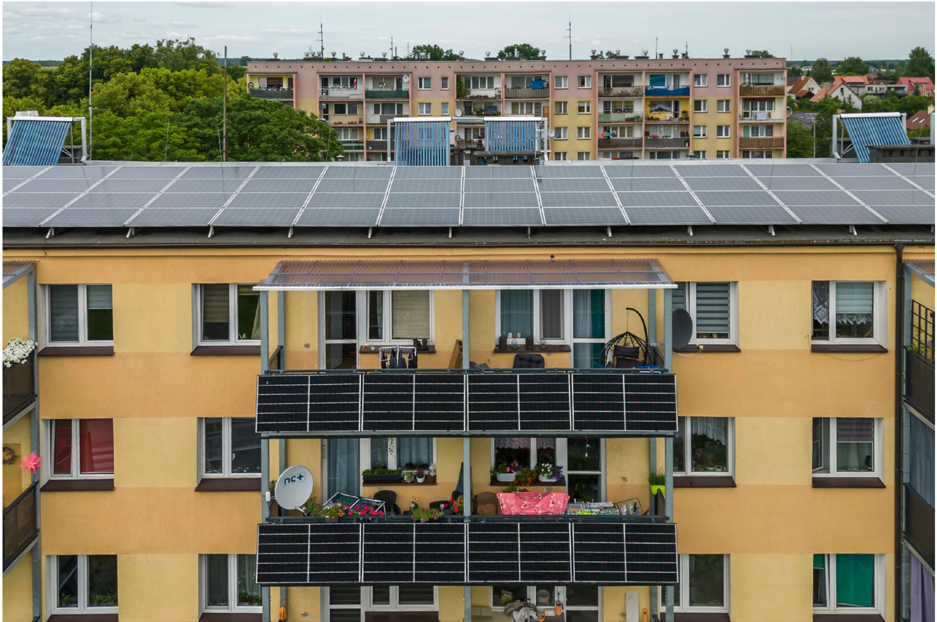
Szczytno, Poland - A Soviet-era housing unit that has been regenerated with photovoltaic panels on balconies and roof and a heat pump system for heating and cooling.